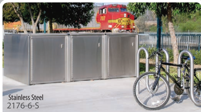
Stainless Steel 2176-6-S